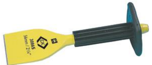
Electricians bolster with grip