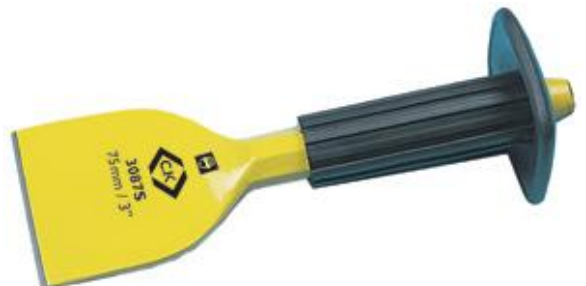
Brick bolster with grip